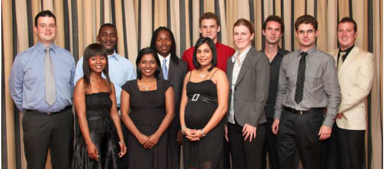
Photo of Award winners at the 2009 Awards Function.